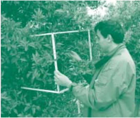
Placing the counting frame into the tree canopy