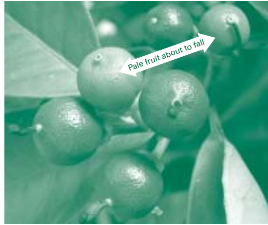
Fruits which are paler in colour are about to fall and should not be included in fruit counts.