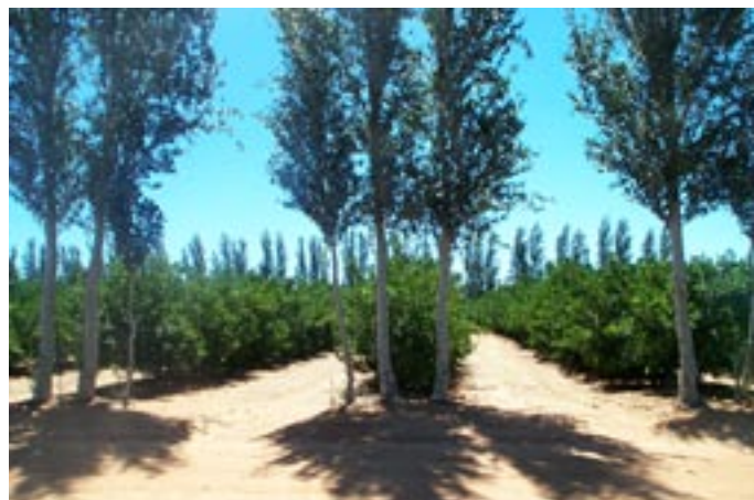
Photo 5: Three Poplar trees are used at the end of tree rows in South Africa and some parts of Australia when there is not enough space for a full windbreak row.

or frosty air. This can result in frost damage to trees and fruit. The windbreak design needs to include an air drainage break in the lowest part of the protected block so cold dense air drains away from the crop.