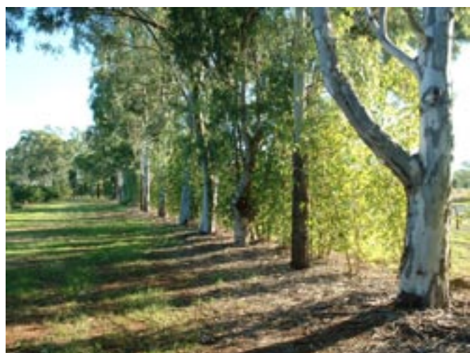
Photo 6: A windbreak of mature Eucalypts inter-planted with bamboo to compensate for the loss of the Eucalypt's lower branches.

Figure 1 indicates one type of windbreak, showing different sized trees, and indicating that the tallest tree does shed its lower branches when mature. This shedding of lower branches would leave a gaping hole if there were no lower storey tree protection. There are also many successful windbreaks using a single staggered row of trees that do not shed their lower branches if pruned correctly. Single rows of specific type bamboo