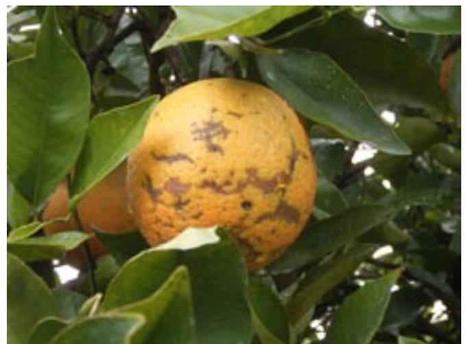
Photos 2 and 3: Wind scarring on fruit is a major cause of fruit downgrading.