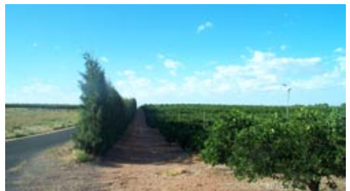
Photo 13: A windbreak of Casuarina trees on John Cox’s property at Waikerie.

On one of John Cox’s properties there are two Washington Navel blocks separated by a road where a wind break was established five years ago on the southern side of the property. Most of the prevailing winds come from the south east although there are also some strong north winds at various times after petal fall. This wind break is comprised of Casuarina cunninghamiana at a 1.5m spacing. They have been hedged and were 10m to