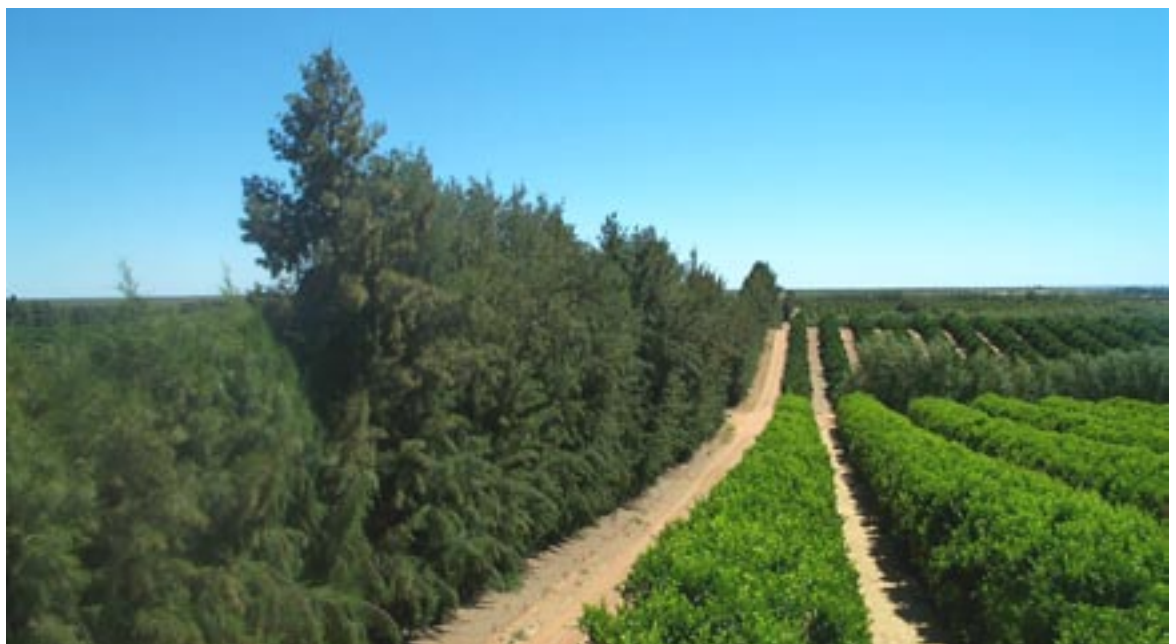
Photo 1: Windbreaks provide protection for trees and fruit resulting in reduced rind blemish.

The geographical location of the citrus planting will partly determine the type of windbreak required. Each citrus growing area and each planting will have specific windbreak requirements. For example, a planting close to the coast with constant multidirectional winds may require a substantial windbreak around and throughout the planting. However in drier