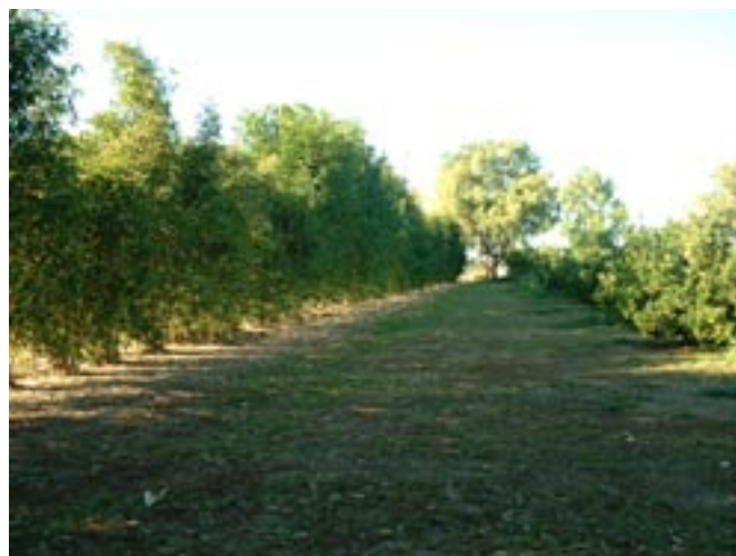
Photo 11: Windbreak trees provide protection but they cause shading. Orientate your windbreak trees in a north-south direction when possible to reduce shading.

reduce fruit quality, flower bud formation and crop yield. A north-south orientation for the windbreak rows will help overcome this problem by giving the adjacent crop rows direct sunlight for at least part of the day. Where the north-south orientation is not possible, the effects of shading must be accepted or the distance between the crop and the windbreak increased. The level of competition will depend on species planted, soil type, amount of water and nutrients applied, distance planted from the crop, final windbreak height, and frequency of pruning. Regular maintenance is critical.