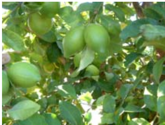
Lemons can be sprayed with GA at the silver green stage to delay harvest.