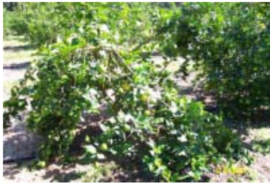
Verna trees with very heavy crop loads and harvested late, were inclined to have significant limb breakages and some trees died as a result.

Lemons can also be harvested when the peel is still green and then artificially coloured using the natural ripening compound ethrel. Degreening allows fruit to be